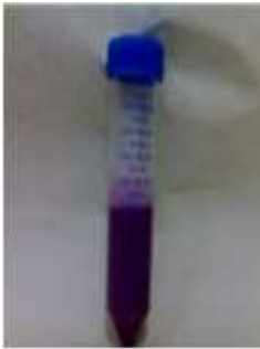
Fig: Sample of Bacteriorhodopsin prepared at IMTECH, Chandigarh

Prasanthi Nilayam has developed a bR-based image edge enhancer for early detection of breast cancer and brought a prototype developed under this program. The prototype developed under this programme has 4f geometry and is based on edge-enhancement technique. Similarly a group at IISc, Bangalore had developed bR embedded waveguide in Mach-Zahnder configuration for all optical switches. Similar efforts in the direction of application for logic gates using bR have been carried out at Dayalbagh Educational Institutes, Agra and ISER, Pune. In the next phase of the program, scaling up of production of bR and good quality bR films will be given priority.