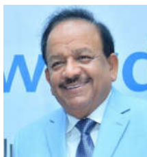
Dr. Harsh Vardhan Hon'ble Union Minister for Science & Technology, Earth Sciences, Environment, Forests and Climate Change

"S&T should provide tools technologies and enable Integrated Water Resource Management. In the context of water scarcity issue facing the country, cost effective renewable powered sea water desalination is crucial to our water security. Our R&D institutions and industries should focus on innovations to scale up sea water desalination at affordable cost"