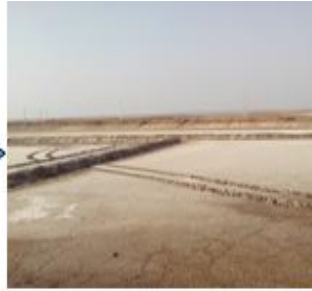
Progressive crystallization through solar evaporation