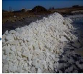
Kainit-type mined salt ( KCl \cdot MgSO_4 \cdot 3H_2O + NaCl )