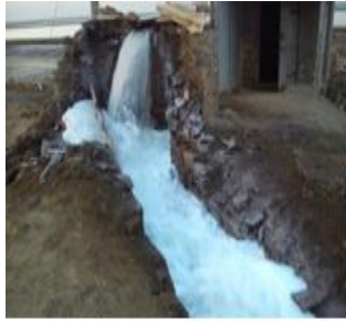
Sea brine (liquid obtained after salt production)