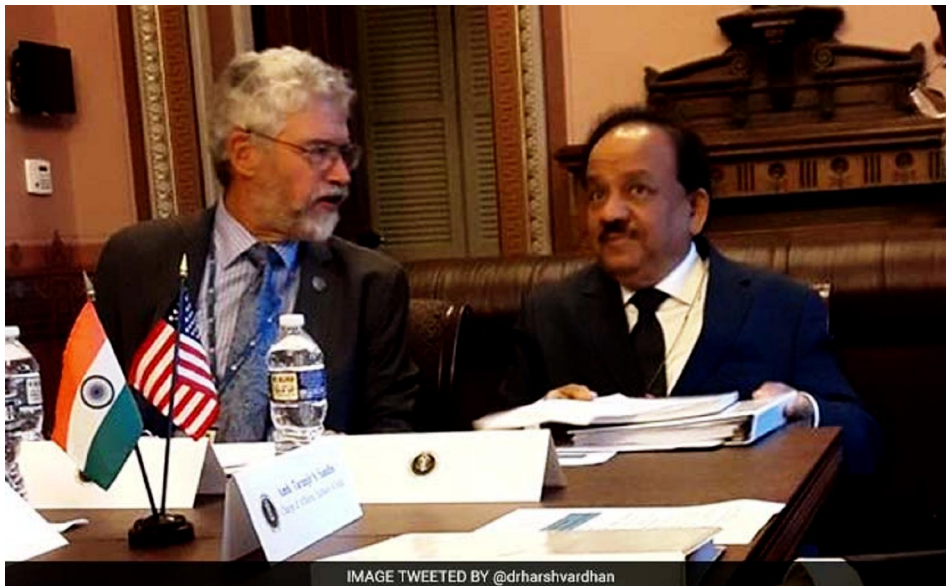
Science and Technology Minister Dr Harsh Vardhan and John Holdren at Indo-US Science and tech Dialogue.

Washington: In a move aimed at furthering the 'Make in India' initiative, India and the US have agreed to add "advance manufacturing" in their Science and Technology Dialogue.