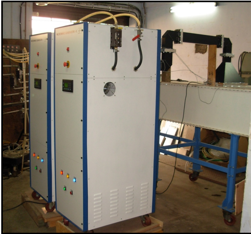
Photograph of field trials of the Variable Power 10 kW Microwave System for Tea Drying at Luxmi Tea Estate, Narayanpur, Assam