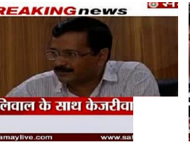
Arvind Kejriwal on Also himself accused with Swã" ;