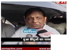
BJP leader met DIG on case of migration of Hindã" ;