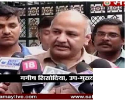
Manish Sisodia on Also Kejriwal accused with Sã" ;