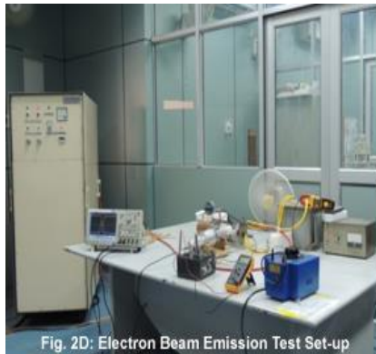
Fig. 2D: Electron Beam Emission Test Set-up