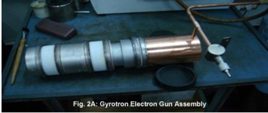
Fig. 2A: Gyrottron Electron Gun Assembly