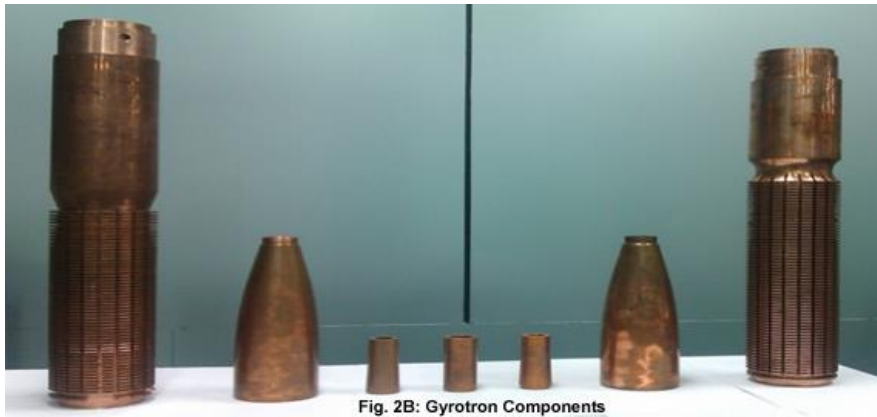
Fig. 2B: Gyrottron Components