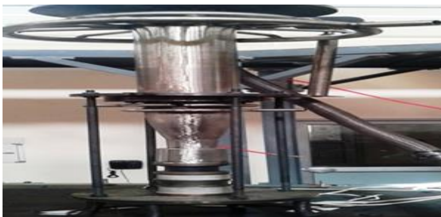
Fig. 1: Duct Mounted 42 GHz, 200 kW Gyrotron