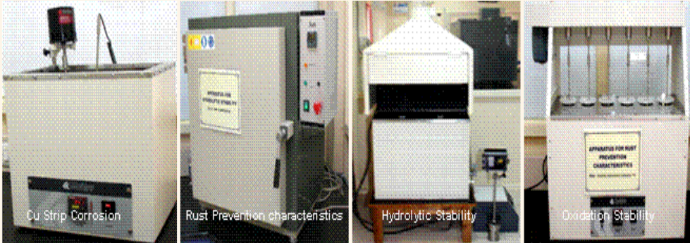
Fig 3. Some Lubricant Testing Facilities Established

formulating with antioxidants and pour point depressants. Epoxy oil exhibited very high viscosity and after formulating with suitable additives it can be used as a base stock for industrial gear oil.