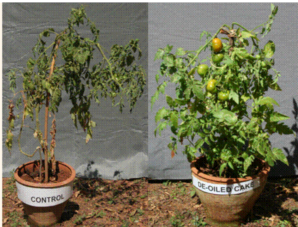
Fig 2. Control Plant (Left) and Plant Grown using De-oiled Cake (Right)

Purification of Crude Glycerol into Different Grades: Crude glycerol is produced as a by-product of the transesterification reaction during the production of biodiesel and contains methanol, water, alkali, soap and organic matter. The reactive extraction process developed during execution of the project proved to be an alternate and an efficient recovery approach to get pure glycerol from crude glycerol. The recovery of pure glycerol from aqueous effluent streams via reversible reactions was achieved by an acid catalyzed condensation reaction of glycerol with aldehydes and ketones to form acetals that were hydrolyzed to recover the glycerol in purest form. Compared to evaporation and distillation, extraction process is advantageous as the energy requirement is lower. Based on the data generated during the course of this study, it is possible to adopt the methodology for the purification of glycerol obtained from different types of minor oils during biodiesel production.