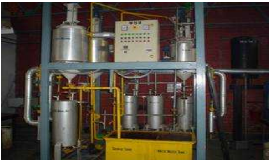
Figure 2: Biodiesel Pilot Plant