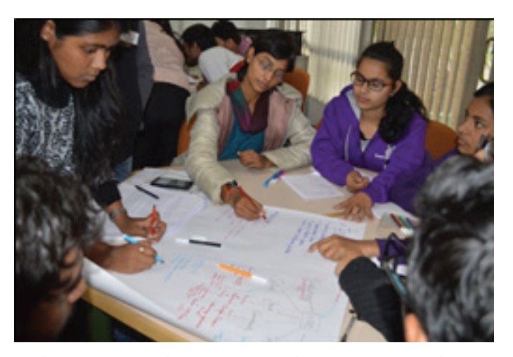
Students interacting during sessions and presentations to enhance their leadership potential and establish networks