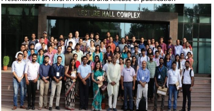
AWSAR workshop participants