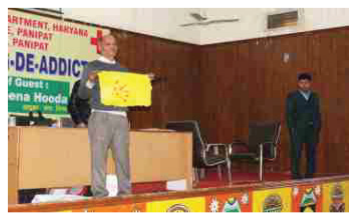
Training workshop on Explaning Science behind so-called Miracles