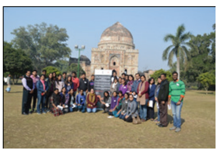
Students interacting with experts on the use of GPS in Natural Resource Mapping at Lodhi Road, Delhi