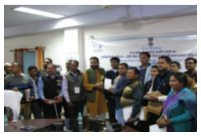
Multi Stakeholder consultation Bahraich