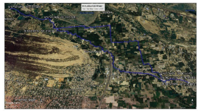
12 KMs GPS line of River Kirudhumal's path in the origination place in Nagamalai hill in Madurai City.