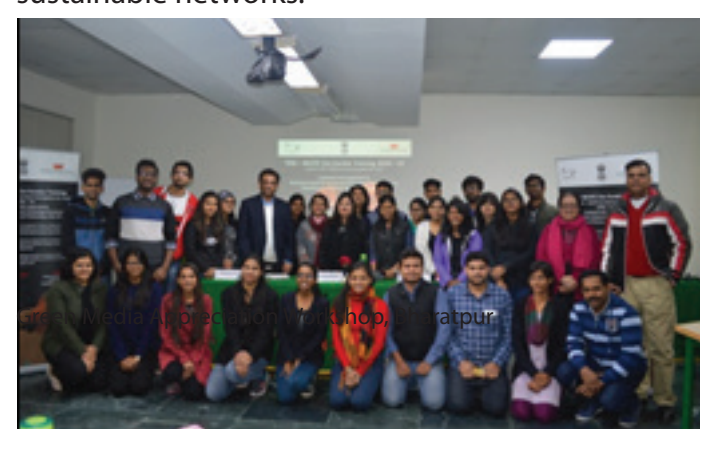
Students on an exposure visit at TERI Gual Pahari with NCSTC and TERI Experts

drawn from different disciplines on environment and sustainability, Science Communication and WASH related issues, communication skills, leadership potential and ability to form sustainable networks.