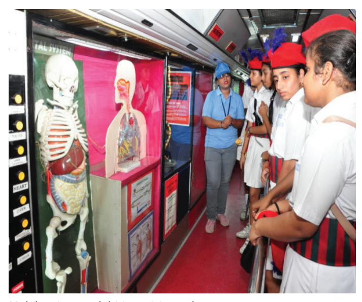
Mobile science exhibitions visit rural areas