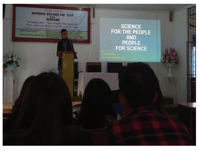
PIC: NSD Celebration at Govt. Champhai College

lectures, debates, quizzes, exhibitions, lectures, workshops, awareness programmes, etc. were organized in states through schools, colleges, universities, R&D laboratories, S&T based NGOs, academic institutions etc. These activities are organized nationwide through State S&T Councils.