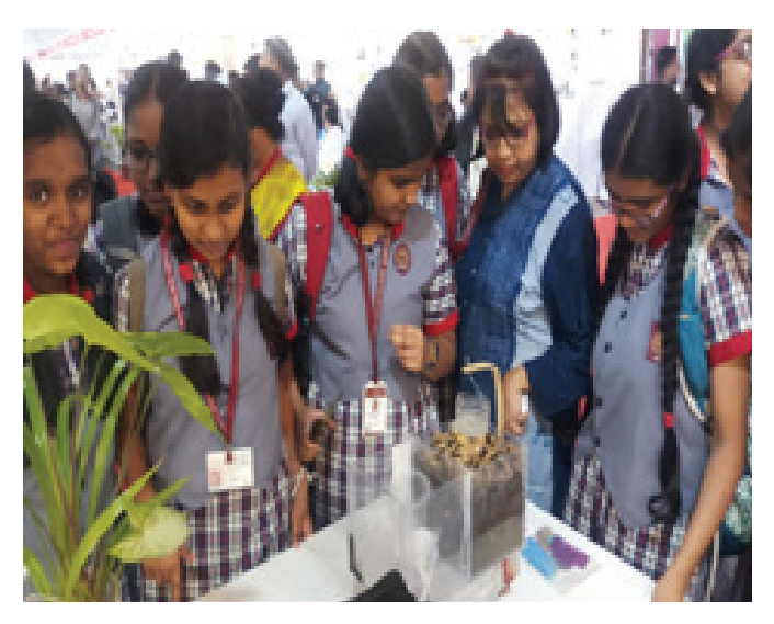
Students at IISF, Kolkata