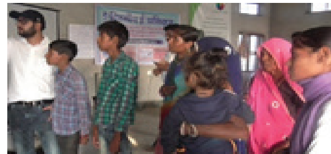
Sessions by Resource Persons in E3 Lab