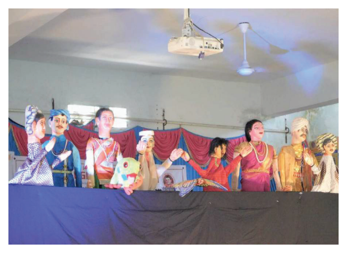
Puppet shows by professional team

Training workshops were organized in 5 districts of Karnataka State – Gadag, Koppal, Dharwad, Bagalkote, and Haveri. During the workshops, 390 young science communicators among teachers, students and professional folk artists were trained and motivated to perform plays to communicate popular science topics. 35 science communication plays were created as a result of the workshops during the trainings. A manual in Kannada on "Puppetry and Science communication in Education" was published on the experience gained at the workshop organised in five districts.