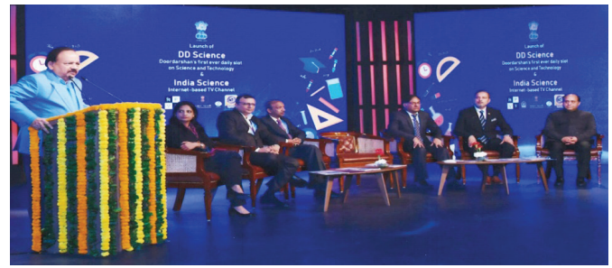
Dr. Harshvardhan, Minister of Science & Technology and Earth Sciences addresses at the launch of DD Science

The Science Channel project, covering DD Science for DTH as one-hour slot on DD National and India Science as a 24x7 internet-based OTT channel, was mandated to VigyanPrasar by DST and formally inaugurated by Hon'ble Union Minister for Science and Technology, Dr Harsh Vardhan.