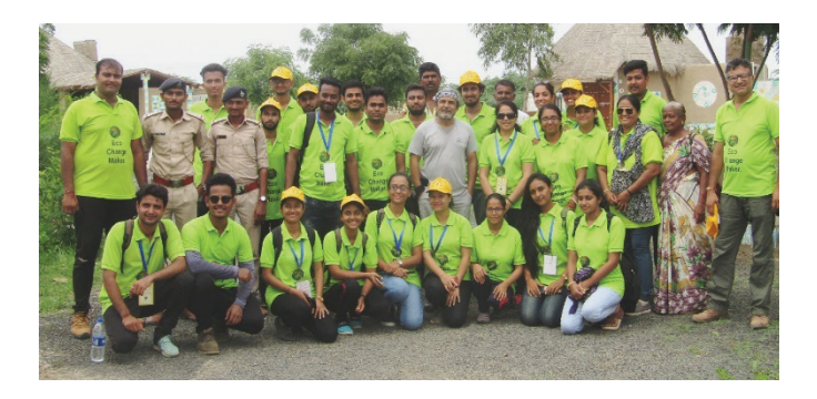
Trainees at KSKV Kachchh University, Bhuj