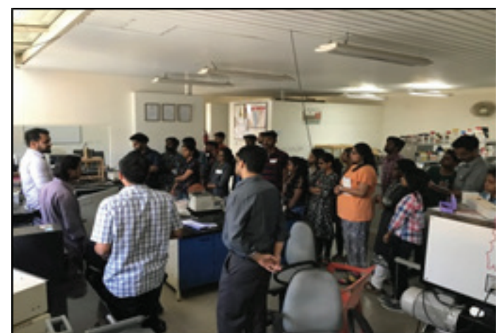
Students interacting with experts during the sessions with a walk through the Environmental Science Lab at TERI SRC, Bangalore