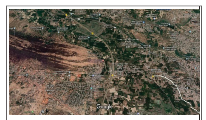
Area of the River Kirudhumal, with no river path line in the Google Map.

obstacles of the river flow. This novel eco-media intervention is very handy in resolving the present-day issues of ecological sensitive areas.