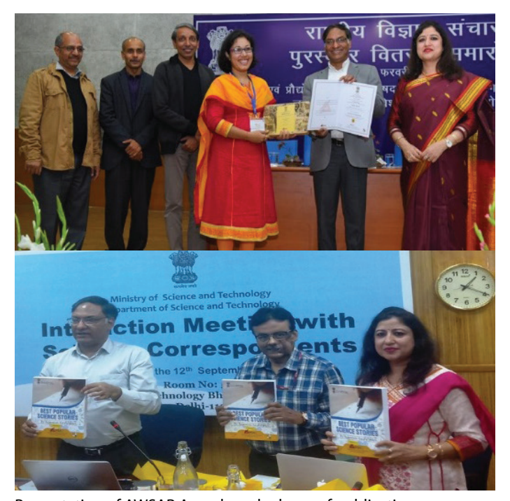
Presentation of AWSAR Awards and release of publication